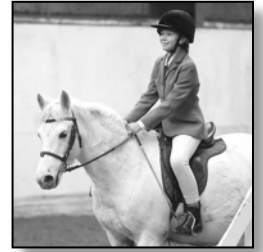
Photos from the Inter Schools Trot Pole Competition