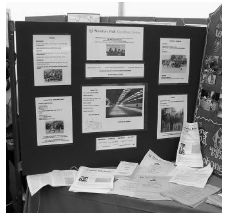
BHS marquee display

Our display featured in the BHS Marquee at the Suffolk Show 2005