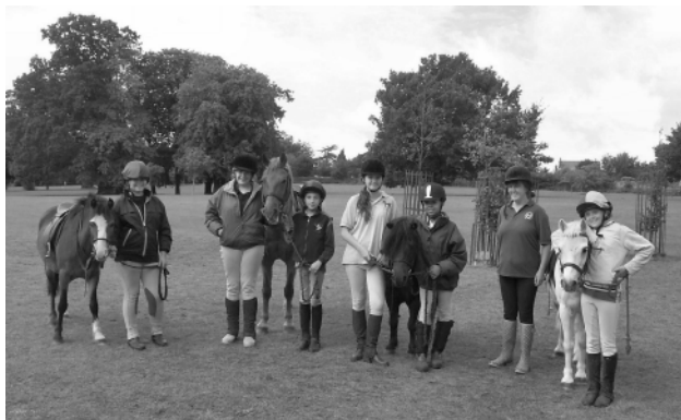
Well done to our team of helpers