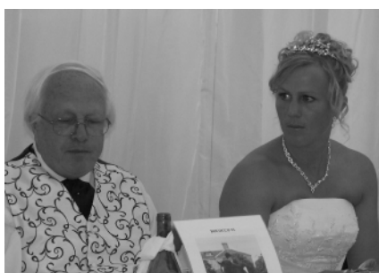
Last minute check on his notes by the bride's father