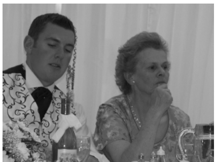
I wonder what my new son-in-law will say in his speech !