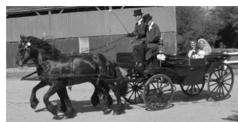
Arrival for the reception