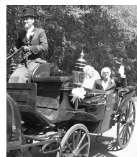
A regal wave