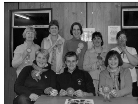
The team to beat in 2012- the EquiQuiz winners 2011

(apologies from the editor for the late submission of this report )