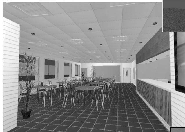
Entrance to cafeteria

Some of these projections are shown here