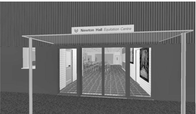
The Main Entrance